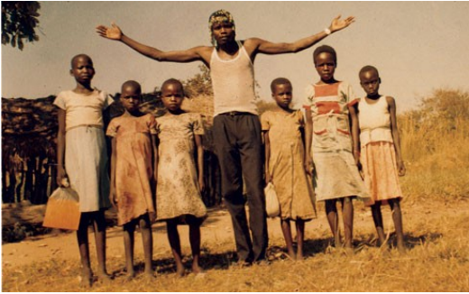
Joseph Kony masquerades as Uganda's "messiah," while simultaneously abducting her children to serve him.

to receive direction on how to better carry-out his rule. No doubt from the influence of his mother who was believed to be a witch-doctor, Adi Amin took tribalism to a level which it had never been in Uganda. He ordered the persecution of the Acholi, Lango, and other tribes, resulting in the mutilation, torture, and murder of up to 300,000