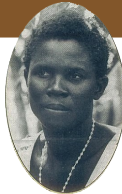
Alice Lakwena, a spirit-medium, claimed to channel the Holy Spirit as she led a national military uprising.

While this fact is no truer of America than it is of Africa or any country or kingdom upon the earth, it is