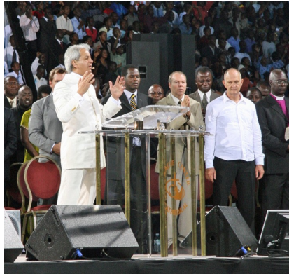
Benny Hinn conducting a nationwide “crusade” in Kampala in 2007.

size that this other gospel is not merely different in word or style, but it bears a totally different nature—and undoubtedly has a totally different effect on the one who believes in it than does the Gospel that the Apostles preached “by which [men] are saved” (1 Cor. 15:2).