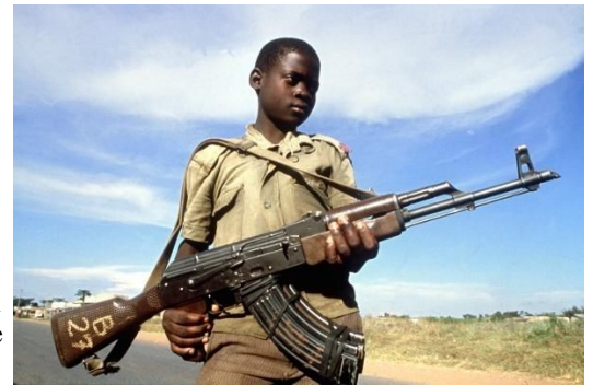
Child soldiers serve as the backbone of Joseph Kony's rebel forces which have terrorized the country for decades.

did little in the way of "restoration." Instead, he claimed the lives of over one thousand followers, many of whom he locked within the building where they met for worship, and then set it ablaze. Afterward, mass graves were uncovered both on that premises as well as in other discrete locations where the cult had operated, revealing that the movement had claimed the lives of hundreds more than those originally calculated.